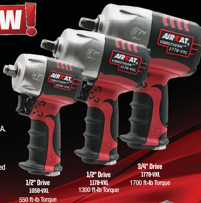
1/2" Drive 1058-VXL 550 ft-lb Torque